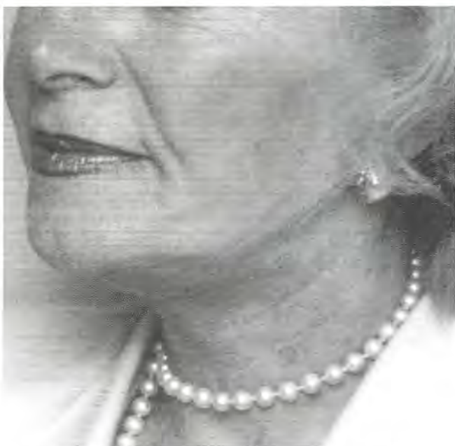
Fig 3. — Top, Preoperative view of a patient with moderate platysmal banding. Center, Six months after submental liposuction, rhytidectomy, and superficial musculoaponeurotic system retrodisplacement; postoperative banding deformity is evident. Bottom, Six months after corrective band surgery; resolution of postoperative banding deformity is evident.

deformity in which they forwarded the concept of anterior or cervical lipectomy and midline plication of platysmal fibers. In 1979, Vistnes and Souther 1 contributed results of anatomic studies in cadavers and patients, concluding that anterior neck bands are related strictly to patients with an undecussated platysma in the midline of the neck and further suggesting that this incidence in the population approximates 40%. Other concepts of repairing the aging neck have included skin excision via Z-plasty and W-plasty, 17,18 skin and fat excision through an "H" incision with one vertical and two horizontal lines, 19 submandibular lipectomy, 20 anterior platysmal band excision, 21 Z-plasty of anterior platysmal bands, 22 and mobilization of platysmal muscle slings. 23,24 Many of these procedures lost favor after revelation of postoperative deformities, such as submental dimpling and noticeable incisional scarring. 6